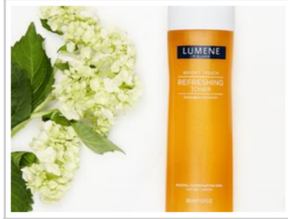
Get Even Skin Tone