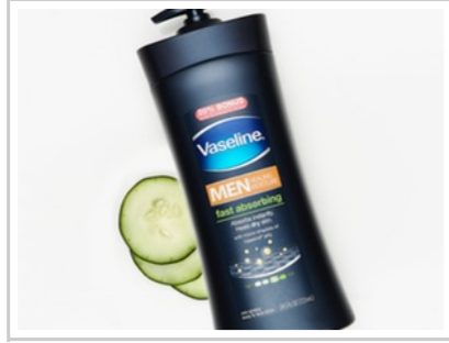
Skin Care for Guys