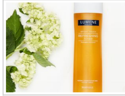
Get Even Skin Tone