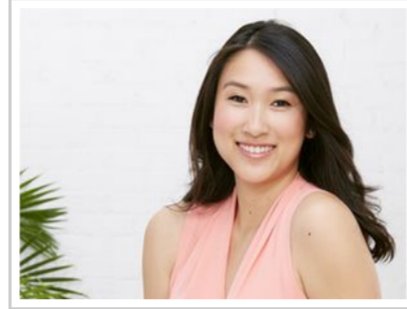
Skin Care with Natural Ingredients