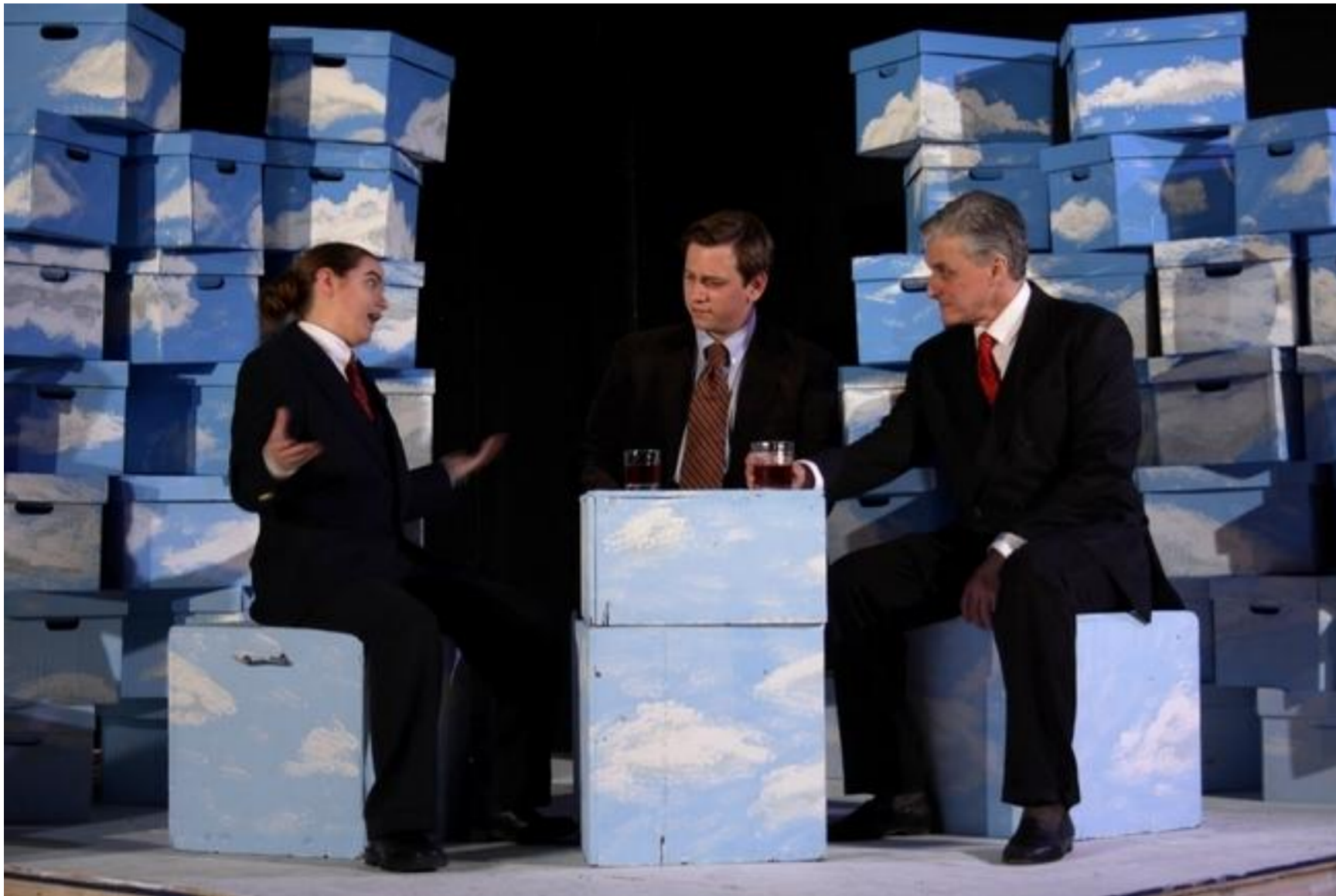
A scene from 'Angels in America, Part One: Millennium Approaches,' through June 24 at Salem Theatre Company.