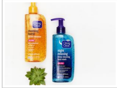
Skin Care for Clear & Oil-Free Faces