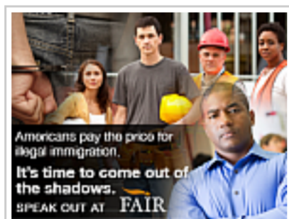
It's time for Americans to speak up about immigration. Leave your testimony on our website.