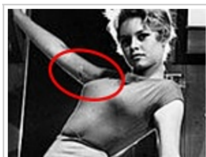
Rarely Seen Historical Photos From The Past That Will Leave You Speechless!