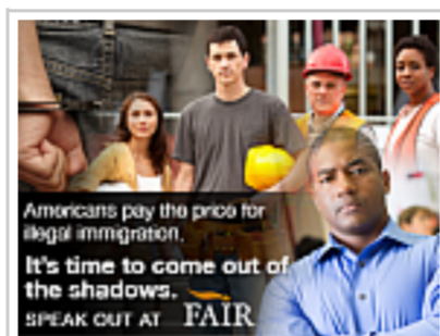
It's time for Americans to speak up about immigration. Leave your testimony on our website.