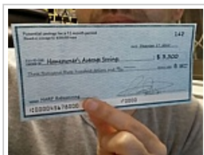
Massachusetts Homeowners Who Have Not Missed A Payment in 3 Years Are In For A Big Surprise...