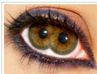
People You Won't Believe Actually Exist