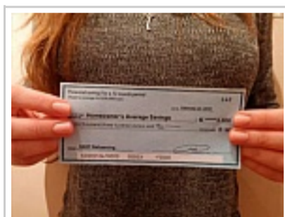
Homeowners Who Have Not Missed A Payment in 3 Years Are In For A Big Surprise...