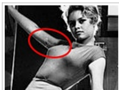
Rarely Seen Historical Photos From The Past That Will Leave You Speechless!