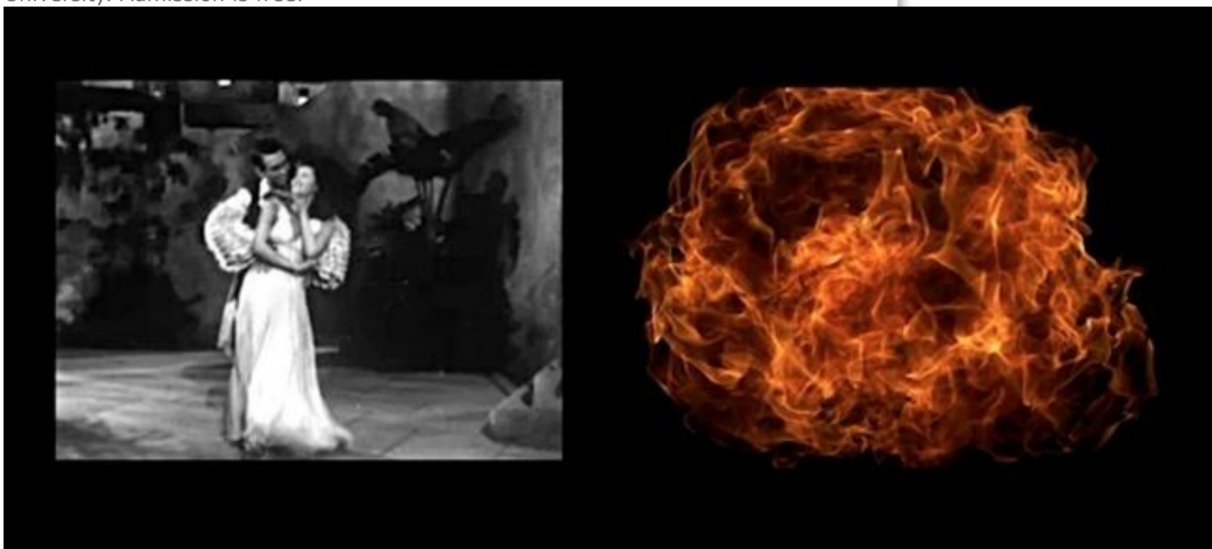
'THERE is no THERE THERE' runs through Feb. 3 in the Winfisky Gallery in the Ellison Campus Center at Salem State University. Admission is free.