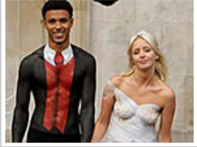
Most Embarrassing Wedding Photos Ever Captured!