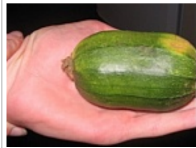
1 Food That Kills Diabetes?