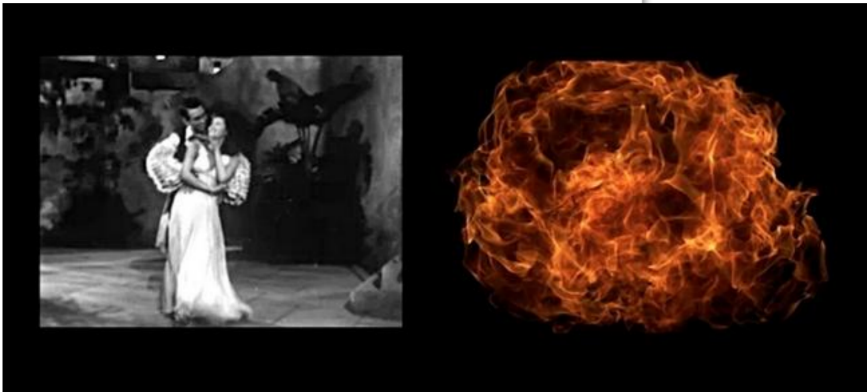
'THERE is no THERE THERE' runs through Feb. 3 in the Winfisky Gallery in the Ellison Campus Center at Salem State University. Admission is free.