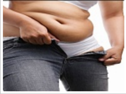
The #1 vegetable that RAPIDLY burns belly fat (eat this now)