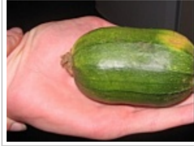
1 Food That Kills Diabetes?