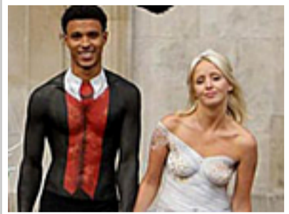
Most Embarrassing Wedding Photos Ever Captured!