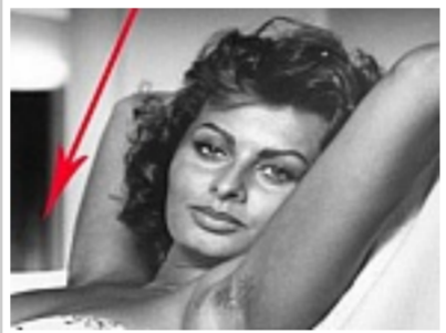
57 Completely Unsettling Historical Photos