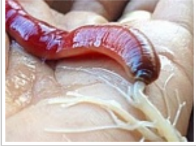
If You Have Gas, Bloating, Constipation or an Upset Stomach Please Watch This