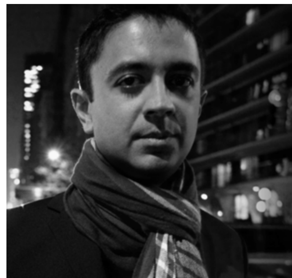
Composer Vijay Iyer

Despite his remarks on that subject ("think about unity," he said, "and what we can do as a collective"), this is a concerto, a work that showcases the virtuosity of a soloist with an orchestra supporting and embellishing. Iyer mentioned studies of concerti by Ligeti and Stravinsky, and Bernstein's Serenade , but Trouble reminds one most of Gunther Schuller . Creamy pastoral melodies get quickly overrun by technical expansions (con legno, ponticello, violent pizzicato), zooming the work off into funk, jazz, or invitingly minimalist textures.