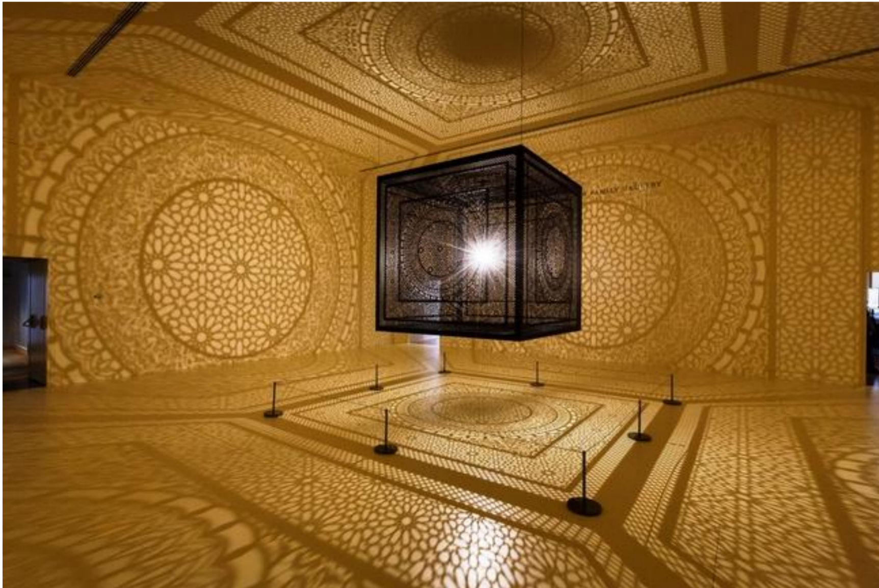
'Intersections' is on exhibit at Peabody Essex Museum in Salem through July 10. The five-foot cube of steel casts shadows in PEM's Wheatland Gallery.