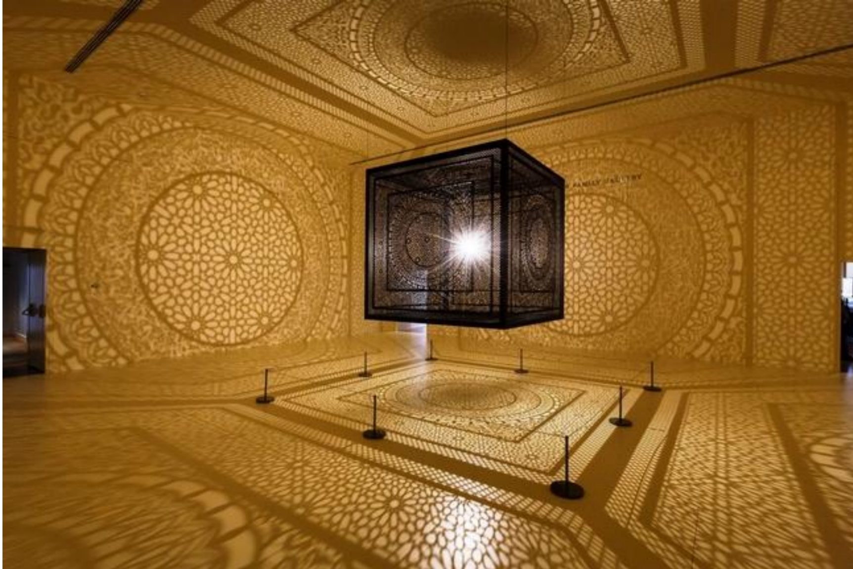
'Intersections' in on exhibit at Peabody Essex Museum in Salem through July 10. The five-foot cube of steel casts shadows in PEM's Wheatland Gallery.