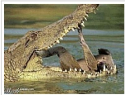
The Photographer Did Not Expect To Capture This!