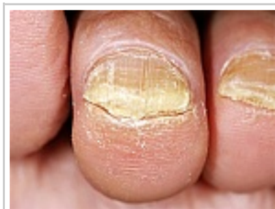
This Man Cured His Nasty Nail Fungus in 10 Minutes! and He'll Show You How