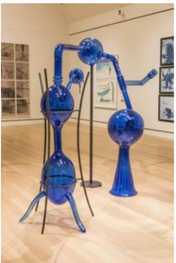
Zoom 'Alchemy of the Soul, Elixir for the Spirits (unit 1)' by Maria Magdalena Campos-Pons at the Peabody Essex Museum.