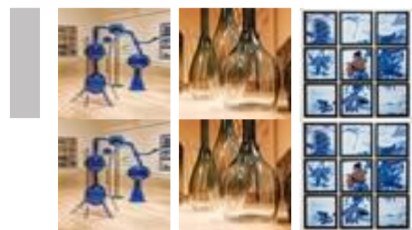
'Alchemy of the Soul, Elixir for the Spirits (unit 1)' by Mariavictoria Campos-Pons. The distillation of her experience mirrors the distillation process itself — transformations of raw materials into something refined and, at least superficially, pleasant.