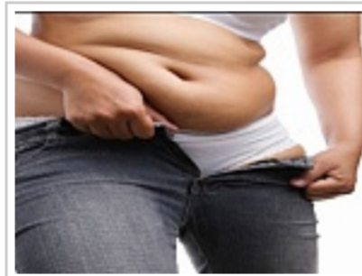
The #1 vegetable that RAPIDLY burns belly fat (eat this now)