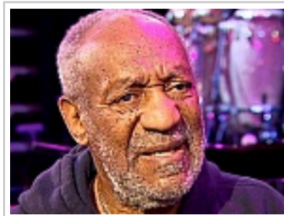
Bill Cosby's Net Worth Will Blow You Away!