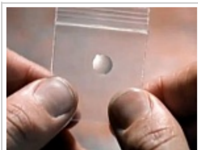
"Genius Pill" BANNED in 49 States Except Massachusetts