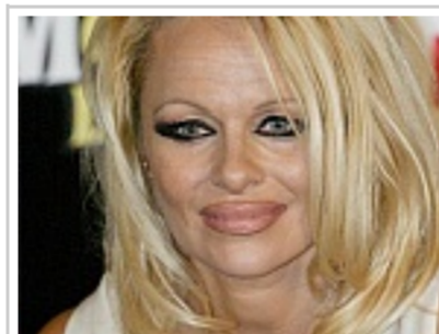
35 Celebs That Have Not Aged Gracefully