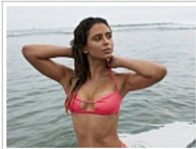
These female athletes are in phenomenal shape and not bashful about showing it off.