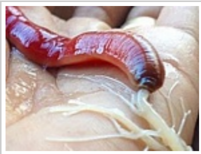
If You Have Gas, Bloating, Constipation or an Upset Stomach Please Watch This