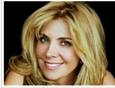
Celebs you didn't know passed away: #17 is Shocking