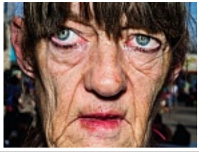
35 Once Famous Celebs That Have Aged Horribly Over The Years (SEE PHOTOS)