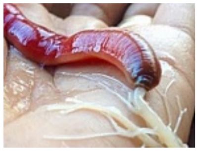
If You Have Gas, Bloating, Constipation or an Upset Stomach Please Watch This