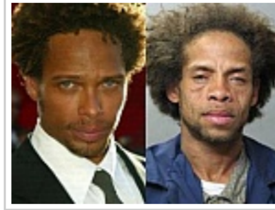
15 Famous Celebs Who Have Committed Horrible Crimes!