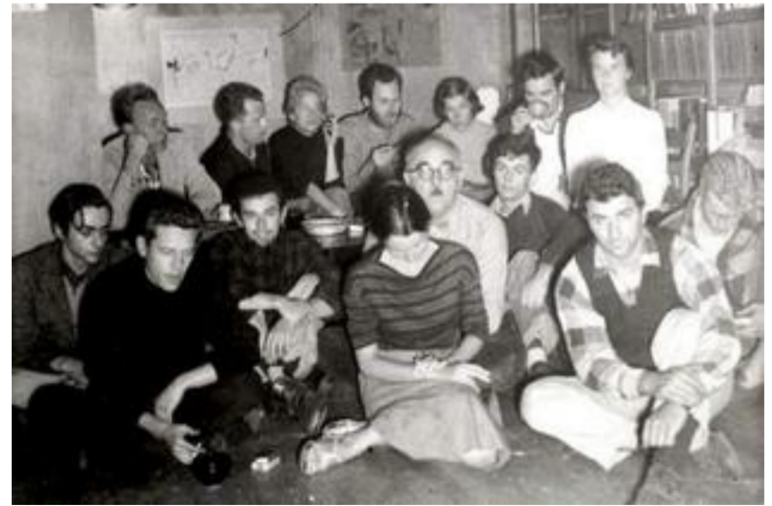
Zoom Charles Olson, with glasses, is at the center of this group portrait of colleagues at Black Mountain College.

By Keith Powers / capeann@wickedlocal.com