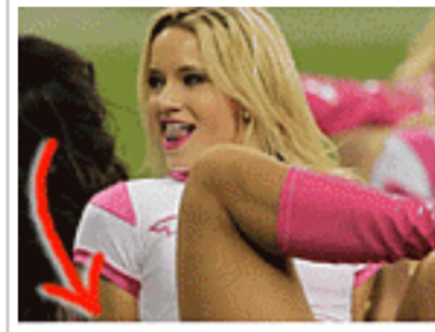
Hottest Cheerleader Embarrassing Moments!