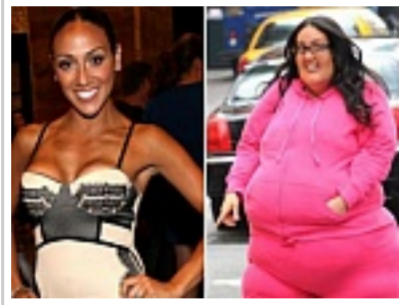
Shocking Photos Of Hollywood's Sexiest Stars That Have Gained Some Weight