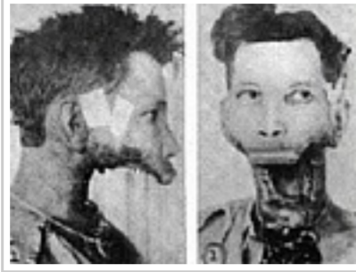
Check Out These Rare Historical Creepy Pics They Will Leave You Speechless