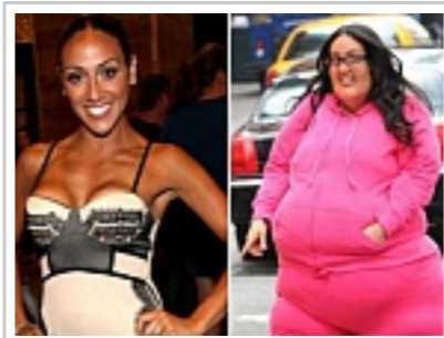
Shocking Photos Of Hollywood's Sexiest Stars That Have Gained Some Weight