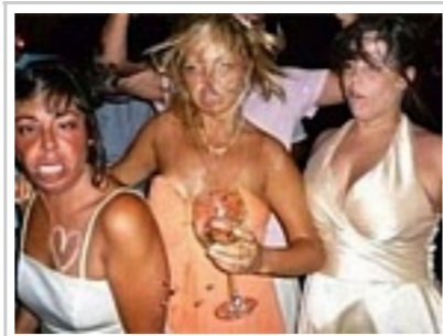
The Most Embarrassing Photos On The Web