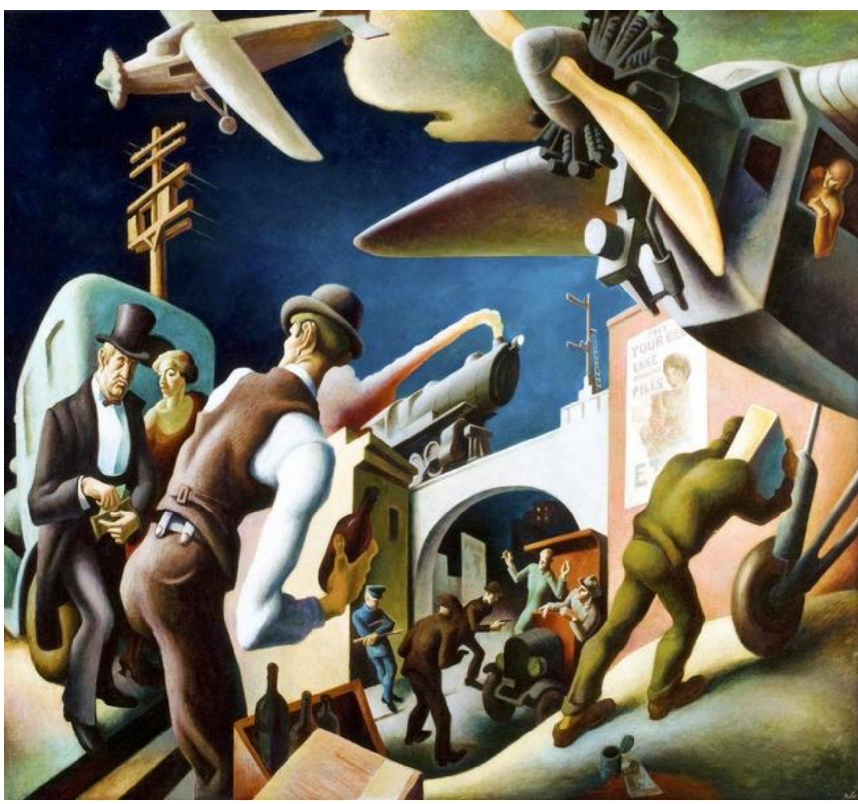
'Bootleggers' by Thomas Hart Benton, 1927.