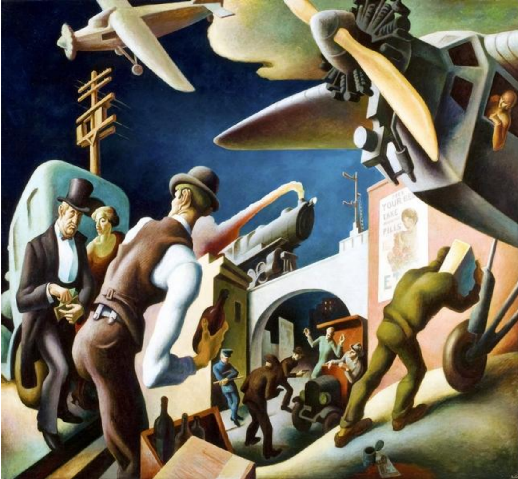
'Bootleggers' by Thomas Hart Benton, 1927.