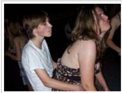
Shocking and embarrassing photos caught on camera. It's amazing what alcohol does to some people.