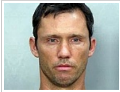
15 Famous Celebs Who Have Committed Horrible Crimes