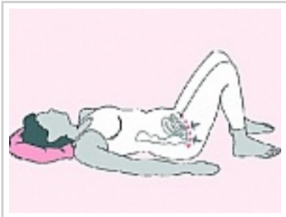
1 Easy Exercise That Destroys High Blood Sugar