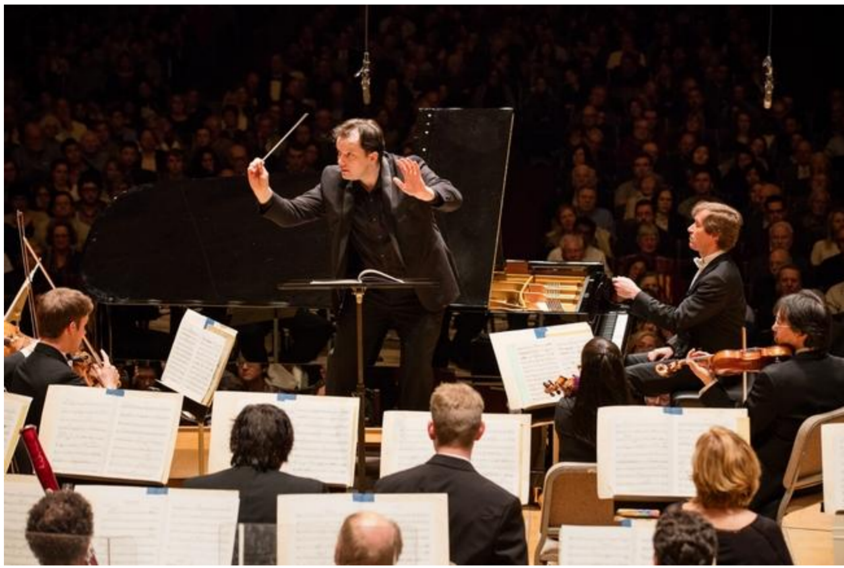
Andris Nelsons and the Boston Symphony Orchestra were joined by pianist Nikolai Lugansky last night for a program of Kancheli, Rachmaninoff and Shostakovich.