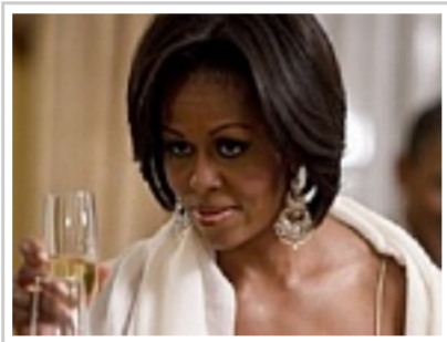
The secret money source of Obama, Clinton and Bush revealed...