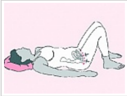
1 Easy Exercise That Destroys High Blood Sugar