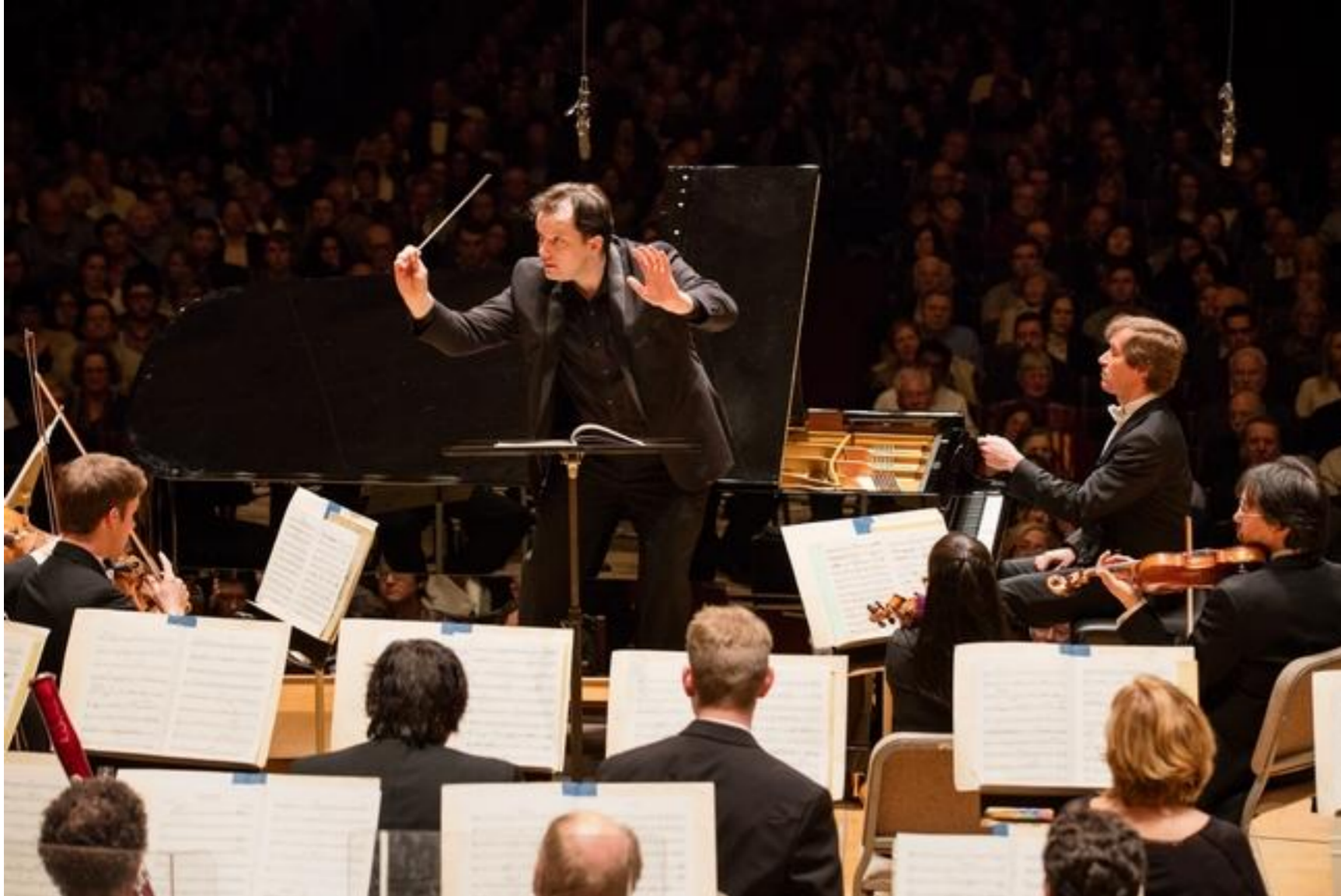
Andris Nelsons and the Boston Symphony Orchestra were joined by pianist Nikolai Lugansky last night for a program of Kancheli, Rachmaninoff and Shostakovich.