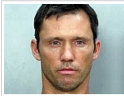
15 Famous Celebs Who Have Committed Horrible Crimes