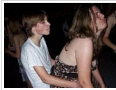
Shocking and embarrassing photos caught on camera. It's amazing what alcohol does to some people.