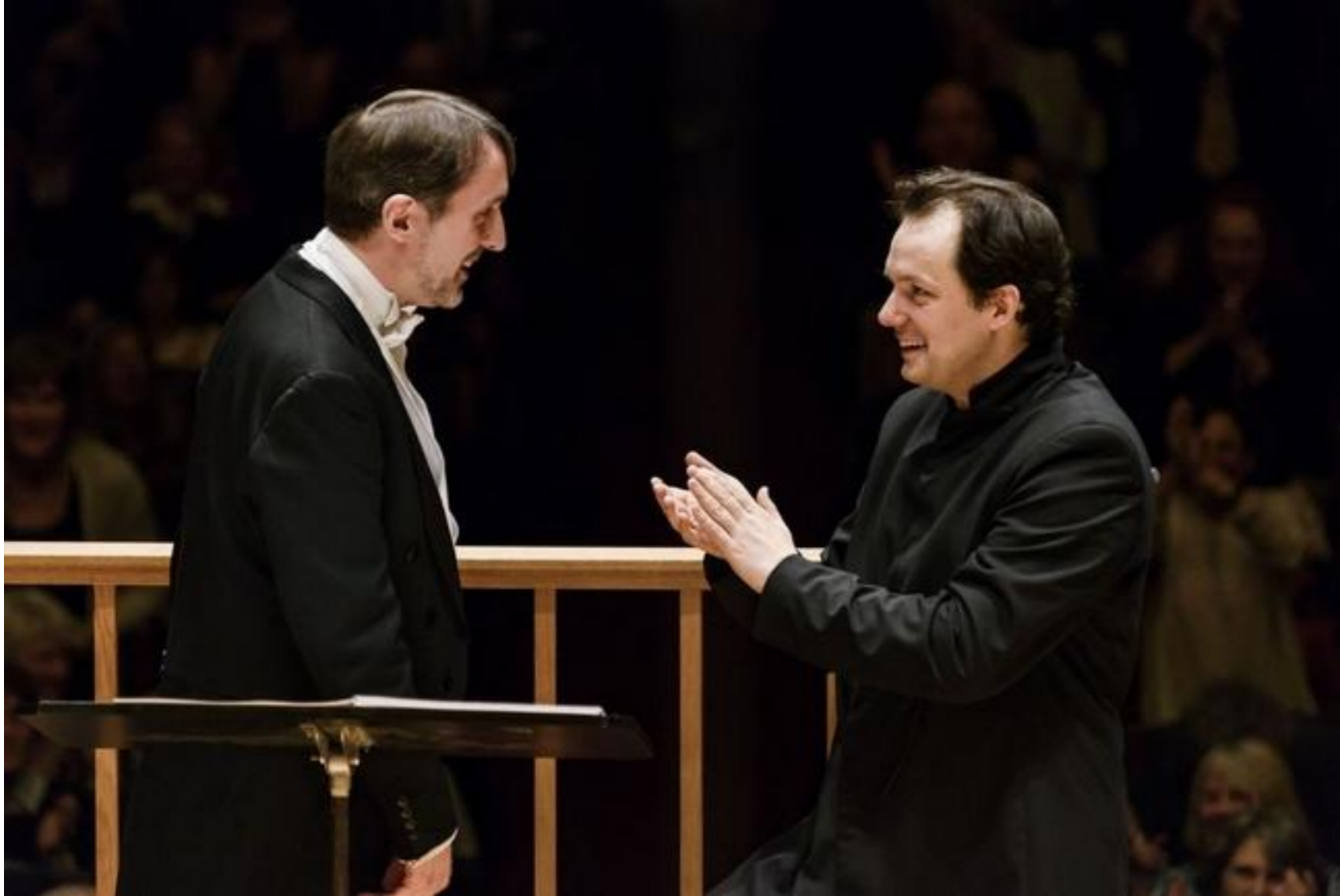
From left, BSO conductor Andris Nelsons and organist Olivier Latry.