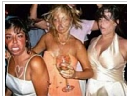
The Most Embarrassing Photos On The Web