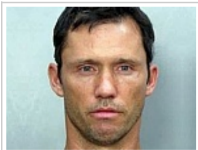
15 Famous Celebs Who Have Committed Horrible Crimes