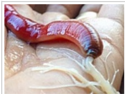
If You Have Gas, Bloating, Constipation or an Upset Stomach Please Watch This