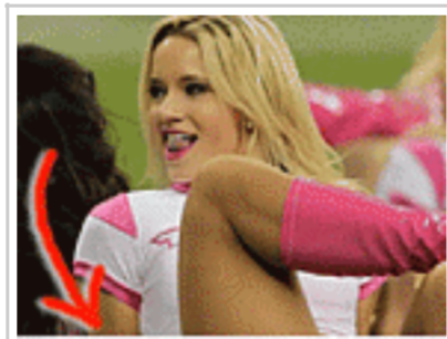
Hottest Cheerleader Embarrassing Moments!