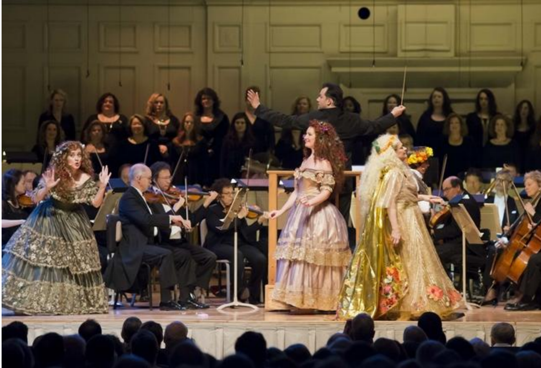
The Boston Symphony Orchestra performs Mendelssohn's "Incidental music to A Midsummer Night's Dream" with singers and actors, Thursday, Jan. 28, 2016.