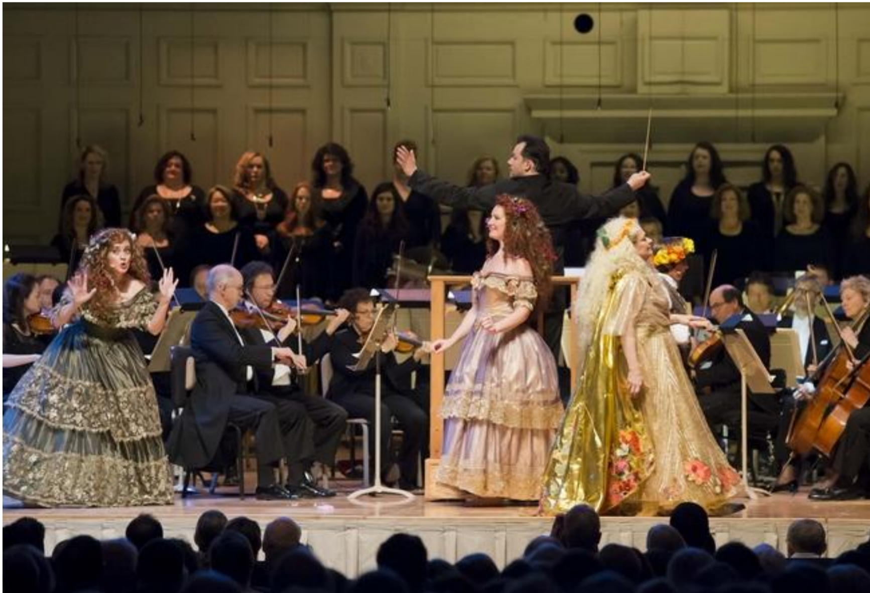
The Boston Symphony Orchestra performs Mendelssohn's "Incidental music to A Midsummer Night's Dream" with singers and actors, Thursday, Jan. 28, 2016.