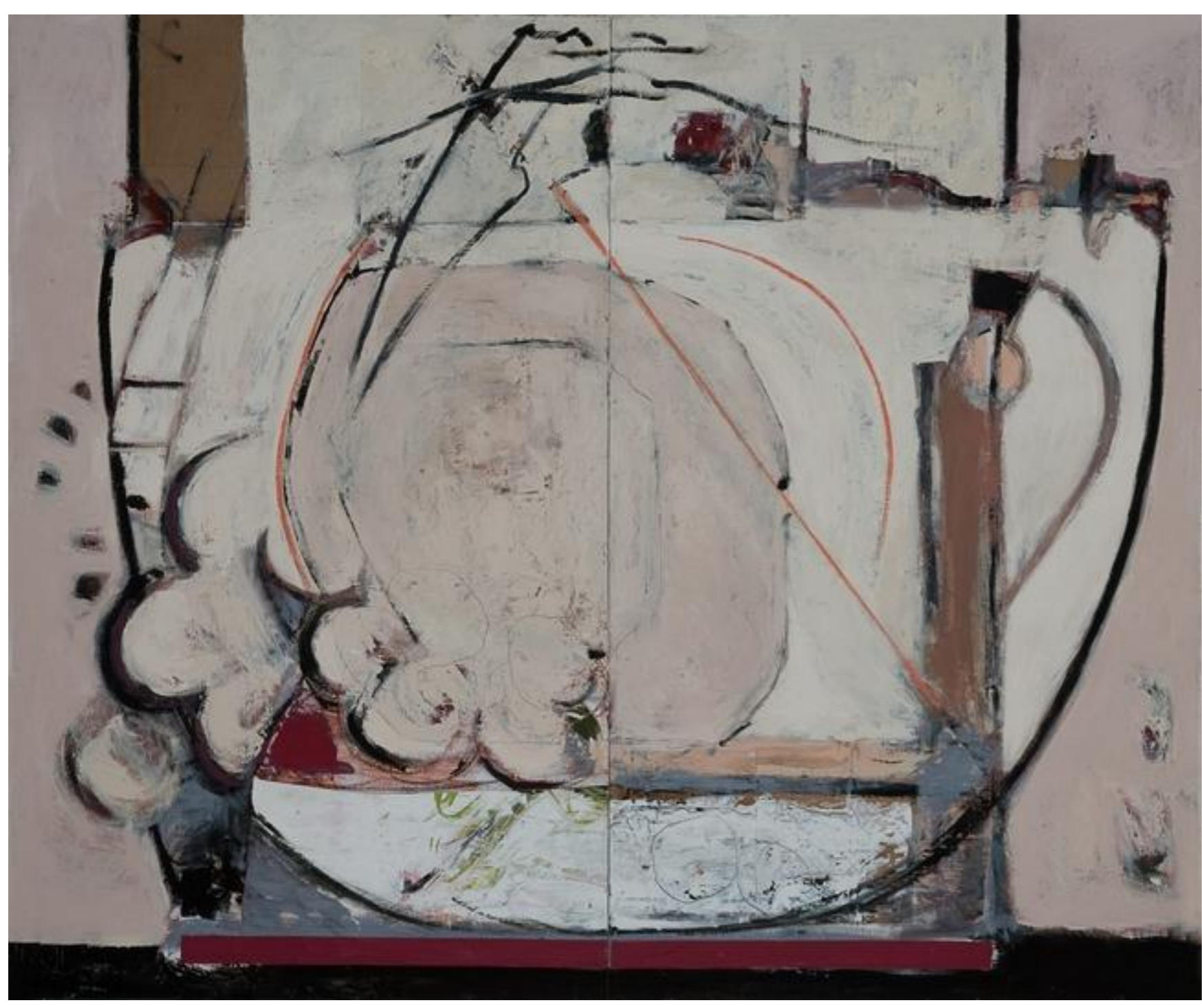
A work from Ruth Mordecai's Container series.