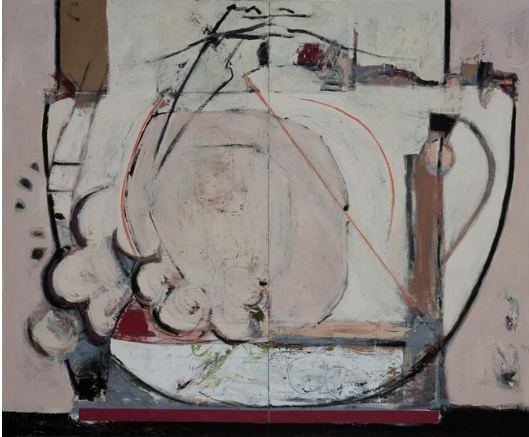
A work from Ruth Mordecai's Container series.