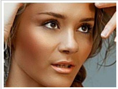
2013: The Best Sunless Tanners: You Won't Believe The Results