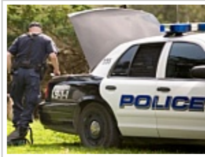
Gloucester - All Massachusetts drivers should not pay their insurance bill, until they