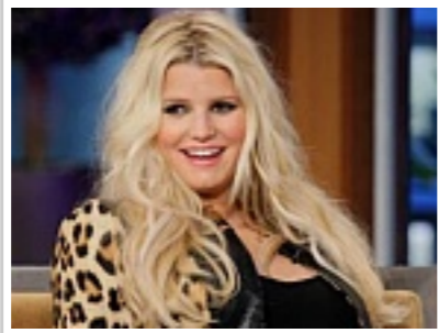
30 Celebrities You Didn't Know Got Bigger Over The Last Few Years. #5 Will Shock You!