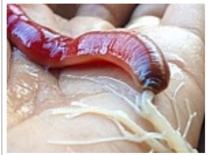
If You Have Gas, Bloating, Constipation or an Upset Stomach Please Watch This