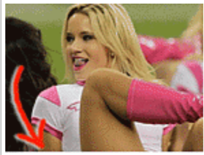
Hottest Cheerleader Embarrassing Moments!