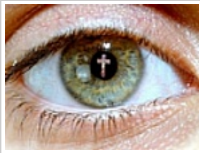
Pastor Reveals a 'Biblical Money Code' - Turns $40,000 into $396,000 (Shocking)