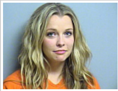
Gloucester arrest records. Who do you know?